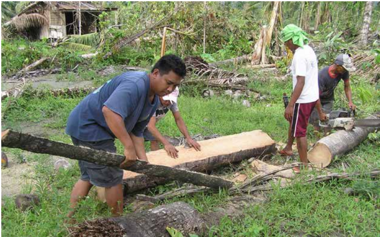
Householder with carpenters preparing coco-lumber. Photo: David Dalgado, Philippines, 2012.