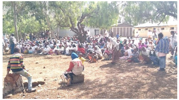
IDPs from Zalambesa residing in Fekadi Primary School in Fatsi