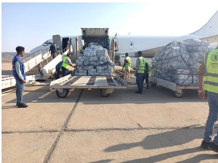
Airlifted ESNFI Cargo Distributed in Adigrat and Hintalo, Tigray Region