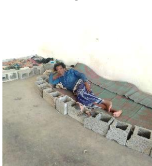
IDPs from Afar coming to Quiha