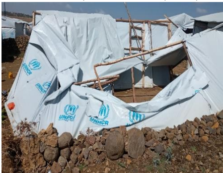
Shelter damage in SC-4 site following heavy rains

In addition, the rainy season has exacerbated the living conditions of the IDPs and host communities alike, with extensive shelter damage reported in Mekelle and Shire IDP sites. Selekleka town experienced heavy flooding which resulted in 5 houses being totally destroyed and 98 partially damaged, while flooding in Sheraro caused damage to 73 houses, indicating the need for shelter repair kits as well as replacement of NFIs that are swept away. With even heavier rains predicted in the coming 3 months, massive preparations need to be in place by all parties to be able to respond effectively and prevent further damages.