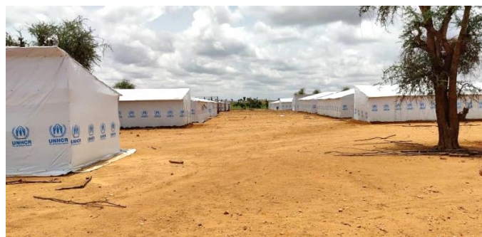
Emergency shelters constructed by UNHCR partner DEC in Adi Abay Relocation Site in Sheraro