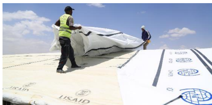
IOM carrying out emergency shelter repairs in Sebacare 4 in Mekelle