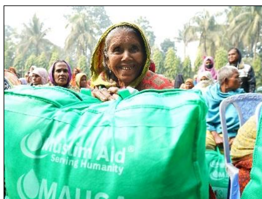
@ Muslim Aid Bangladesh Field Office