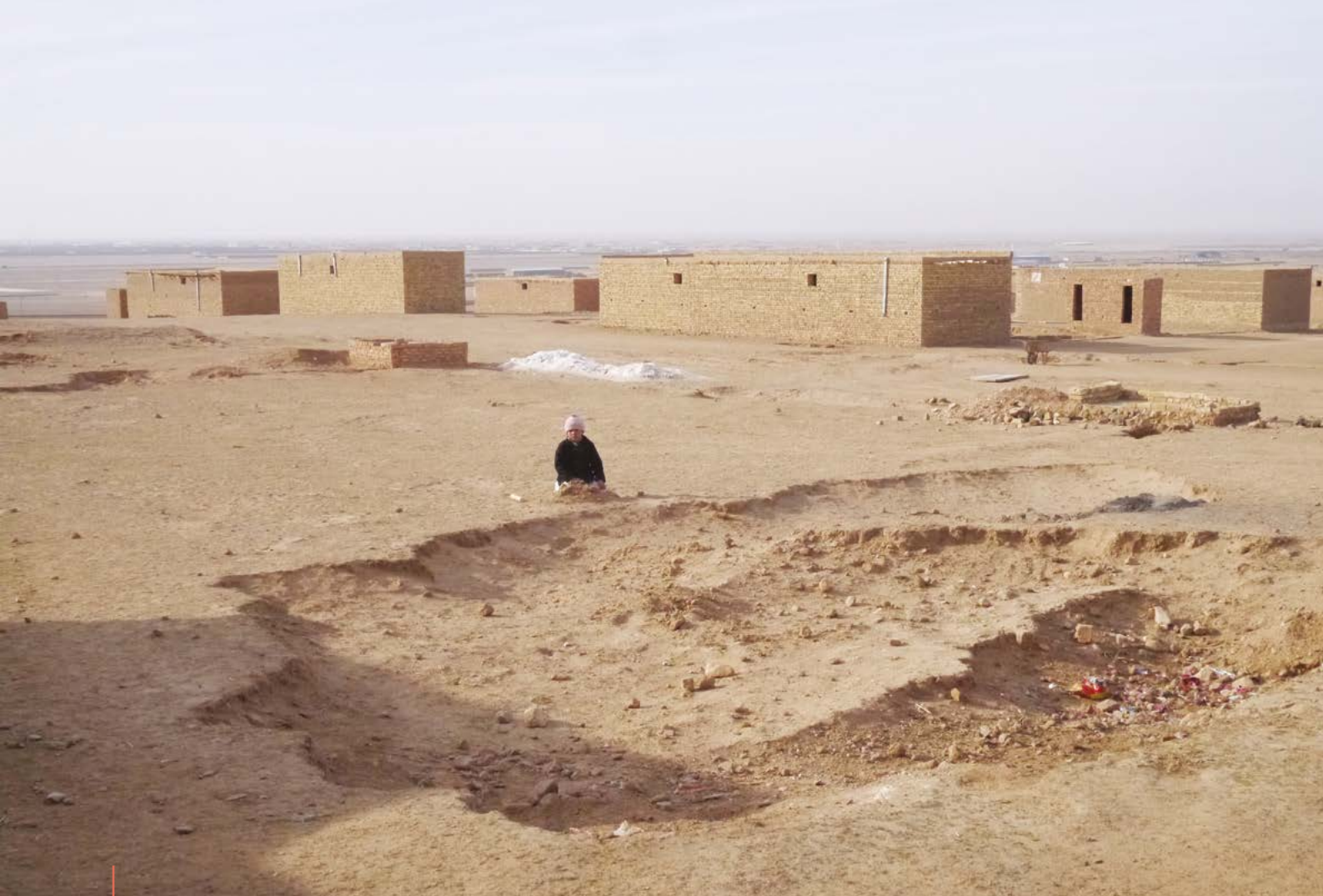
New homes in Qalimbafan village.

The villagers had originally intended to settle in Mazar when they returned to Afghanistan, but they travelled from Pakistan in a convoy of vehicles containing their belongings, and as they neared the city they stopped to pray at the roadside. Locals told them that they could stay in the area and that the land was available under MORR's allocation scheme. They were advised that if they stayed together as a community they would receive government help, but if they dispersed they would not. The community made a collective decision to settle in the area and received 7,000 Afghanis ($120) from DORR to acquire land.