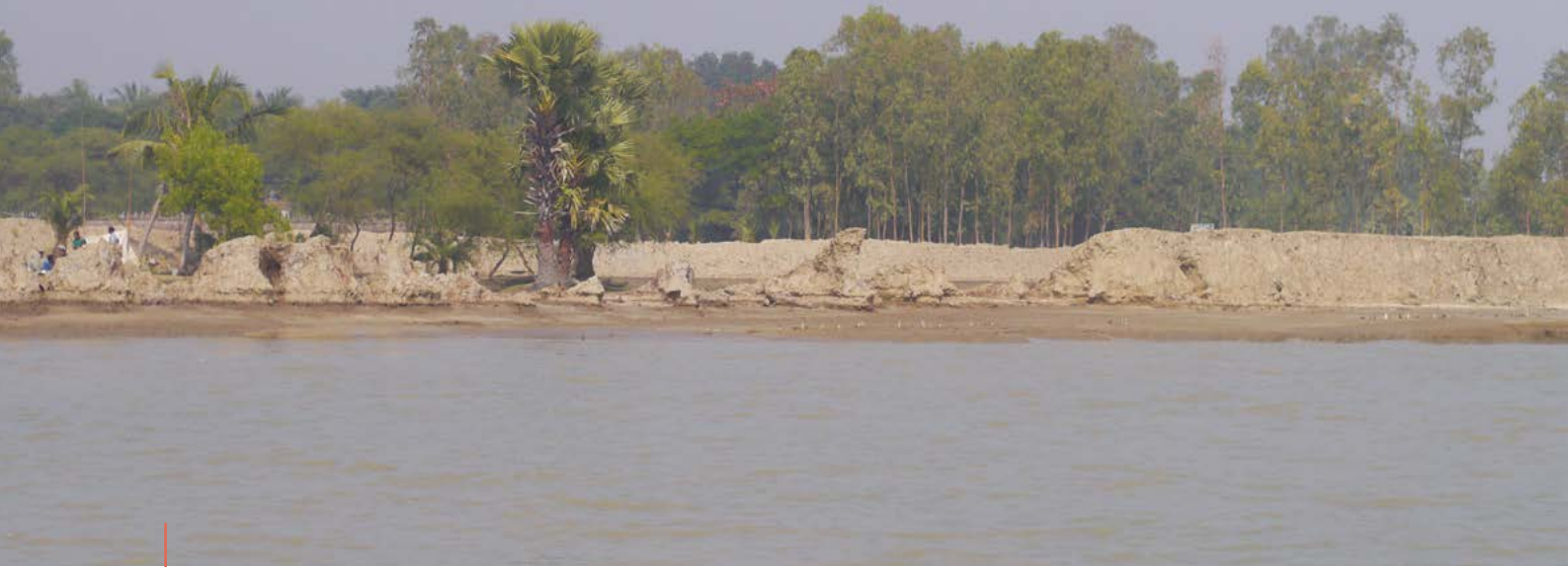
Old and new embankments encircling Ghoramara island.

During a group discussion with members of the displaced community, the focus was on the land ownership issues. Some families lost as much as 30 times the land allocation they received in Sagar, and were not compensated for their loss of livelihood. Some pointed out that those who resettled earlier had slightly better allocations, while later arrivals were given smaller holdings or became landless. Inheritance also puts pressure on land, effectively reducing plot sizes because it is divided between sons after a father's death and leaves many unable to produce enough food even for one family.