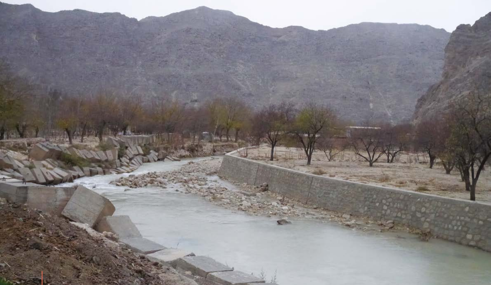
Canal and retaining walls in Sayyad village.

between five and six hours to prepare, but they did not anticipate the extent or severity of the flooding. They were surprised that water levels reached the roofs of some houses, and warned other villages downstream.