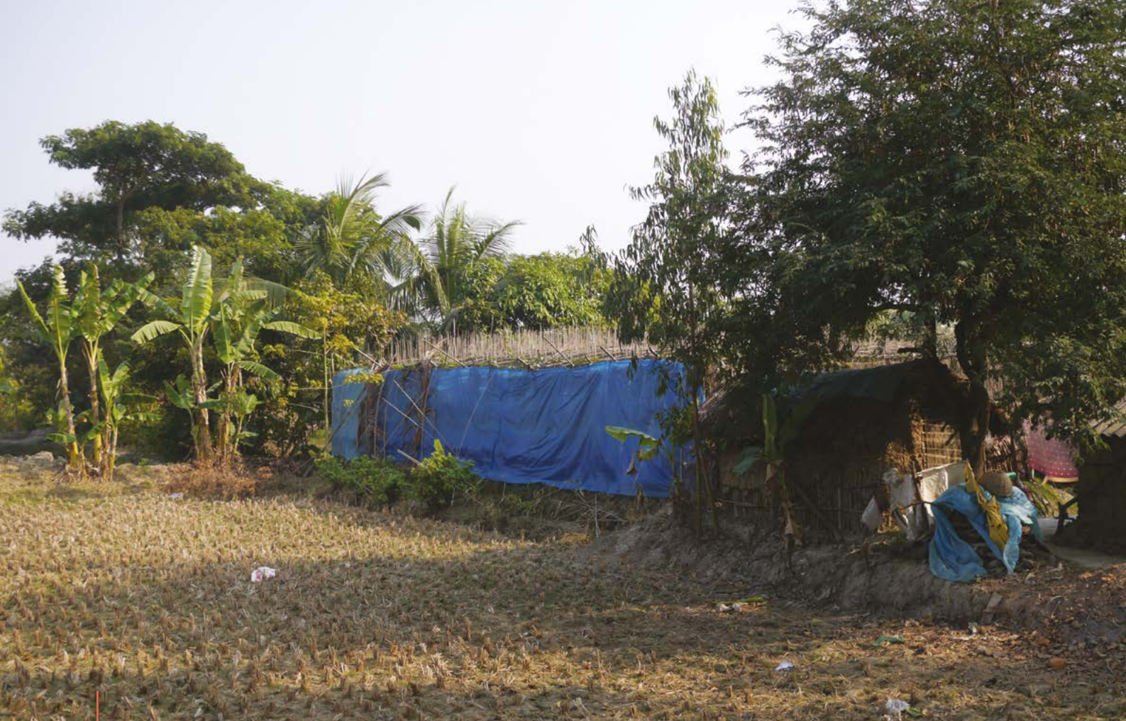
Betel nut plantations near Shilpara and Hendol Ketki villages.

to do anything about it. Members said the government had announced its intention to do the repairs shortly after Aila, but has taken no action. They said they were willing to give up land for the work to be carried out, and appeared to trust that the government would pay compensation in lieu.