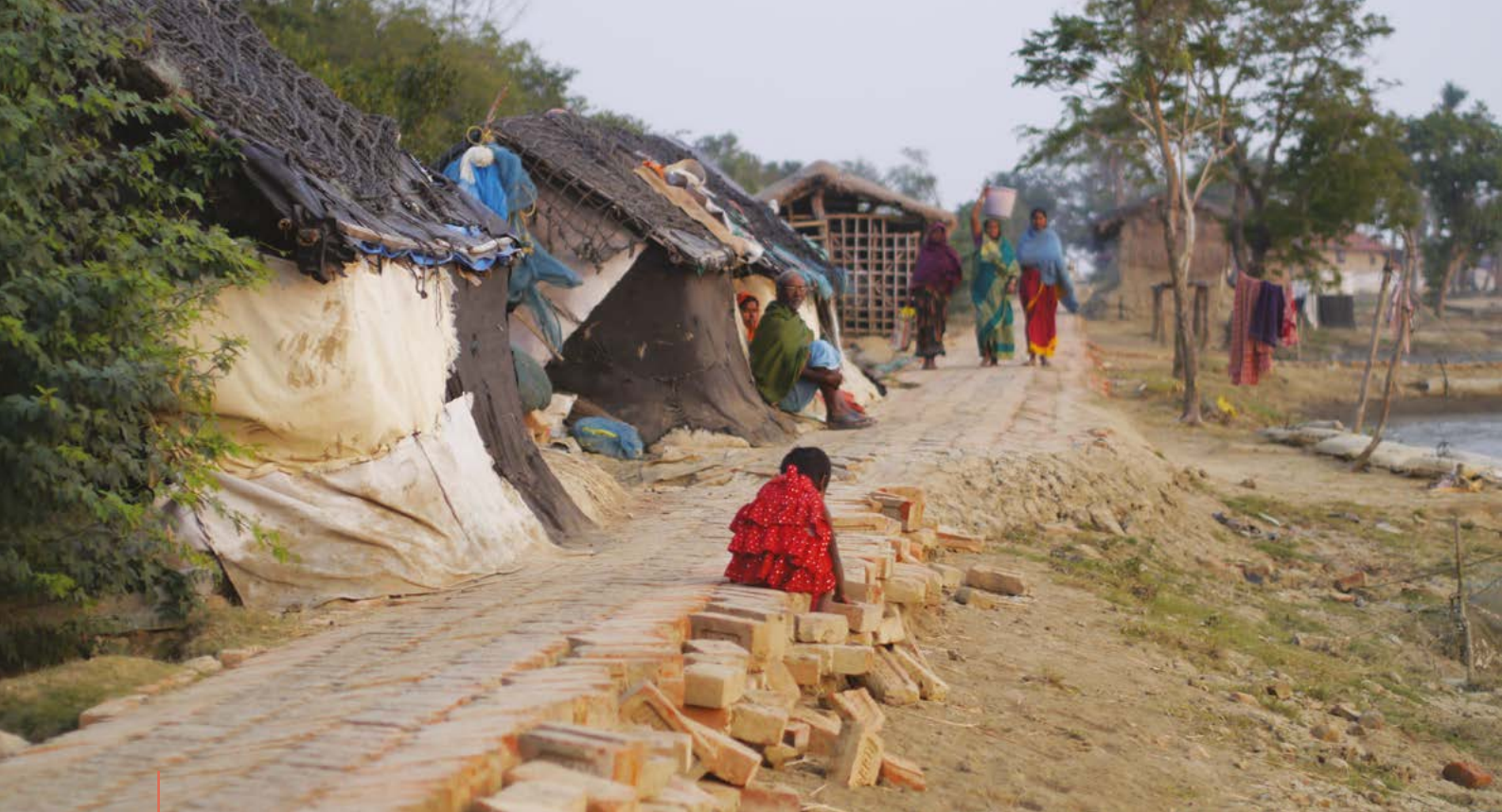
IDPs and their shelters on the roadside in Silpur.