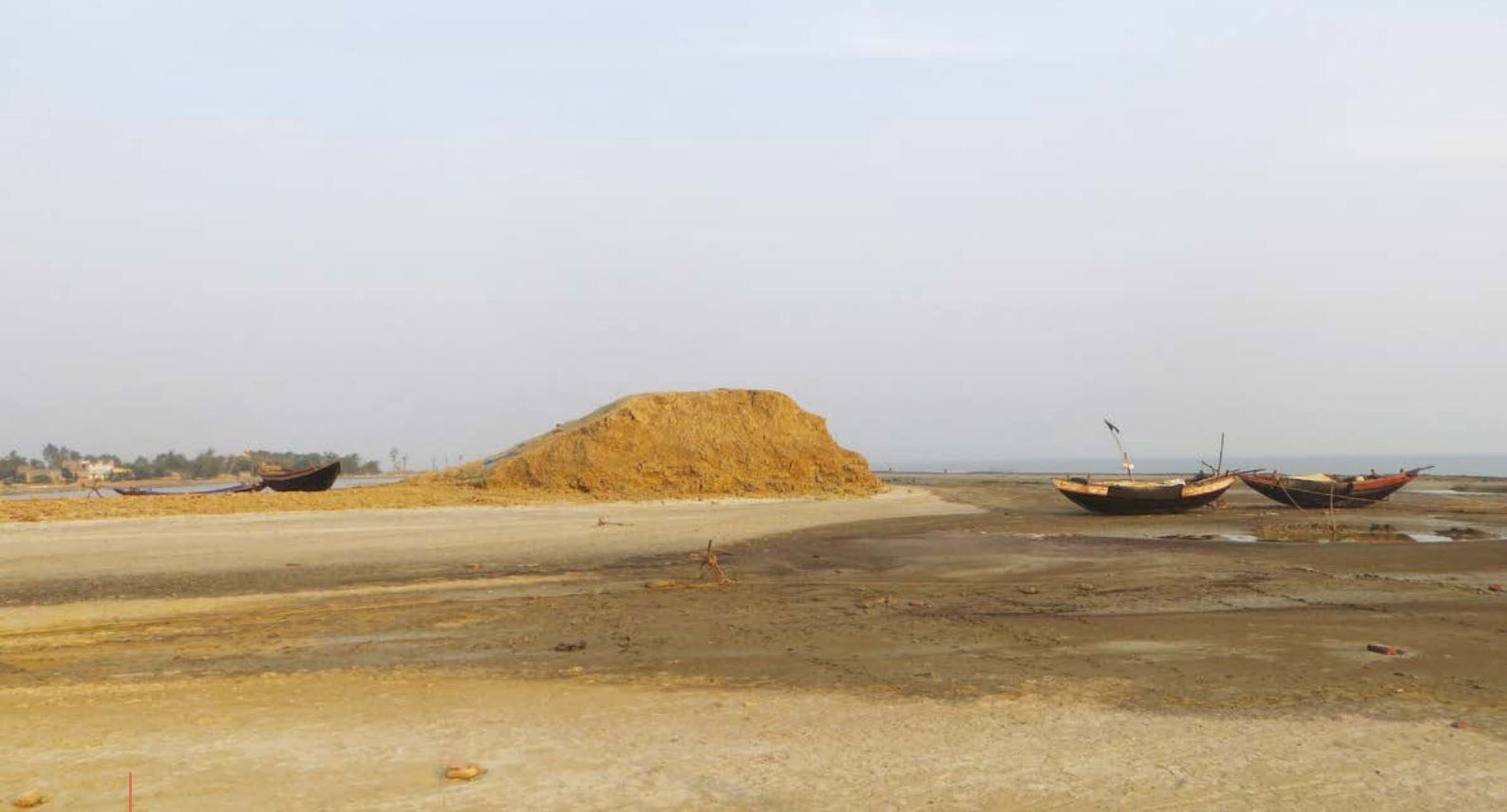
An unfinished embankment in Silpur village, Sagar island.

Community members say they are worried about new floods, because the existing embankments are or seem to be weak. To build better defences, however, the government would need to acquire land and the villagers are unwilling to give theirs up for the purpose. Some of those whose land is needed consider their potential loss to be unfair, because others will benefit at no cost. As hosts to IDPs from Ghoramara and Lohachara islands, they also feel increased competition for land.